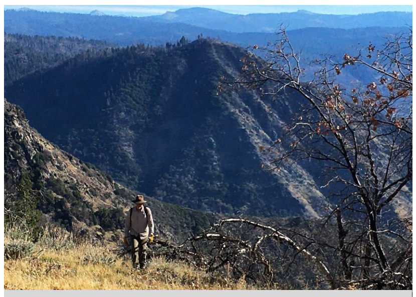
Steve scouting for the "lost" trail along Pinoche Ridge.

Although the Granite Creek Saddle Trail was inaccessible this year due to excessive tree fall, 8 outings were dedicated to scouting and clearing portions of the other highland trails.