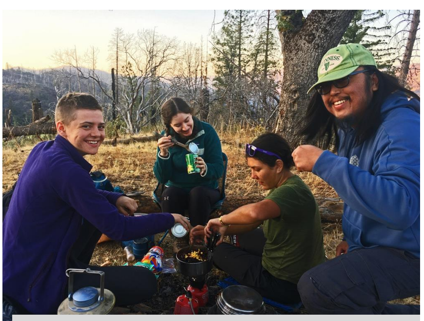
AmeriCorp volunteers at camp-out at the Virginia Creek trailhead.