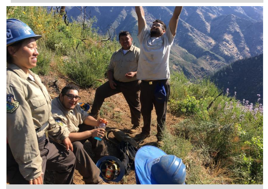
CCC volunteer crew from Fresno taking a break on the Savage Lundy Trail.