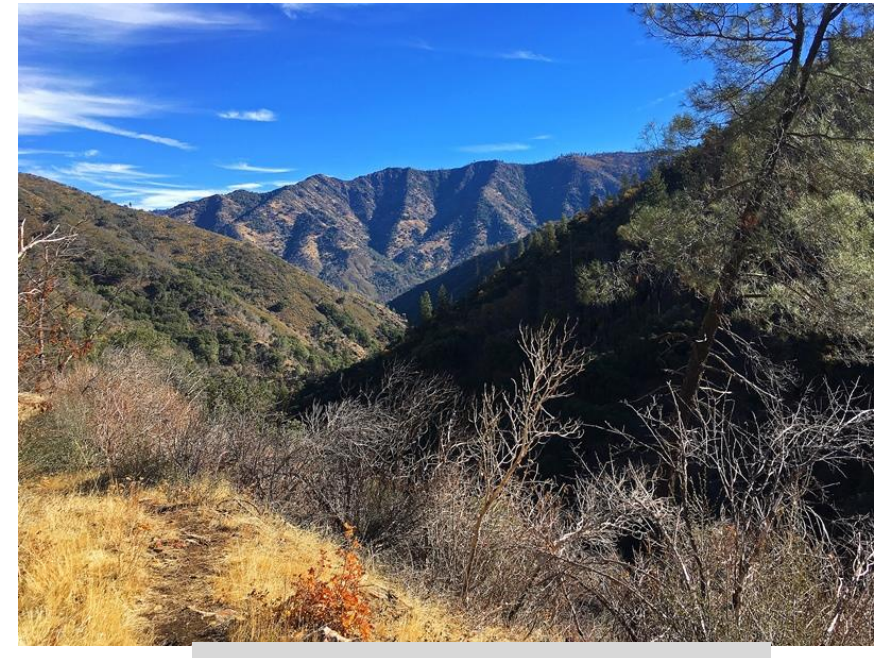
Skelton Creek Trail in near Jerseydale